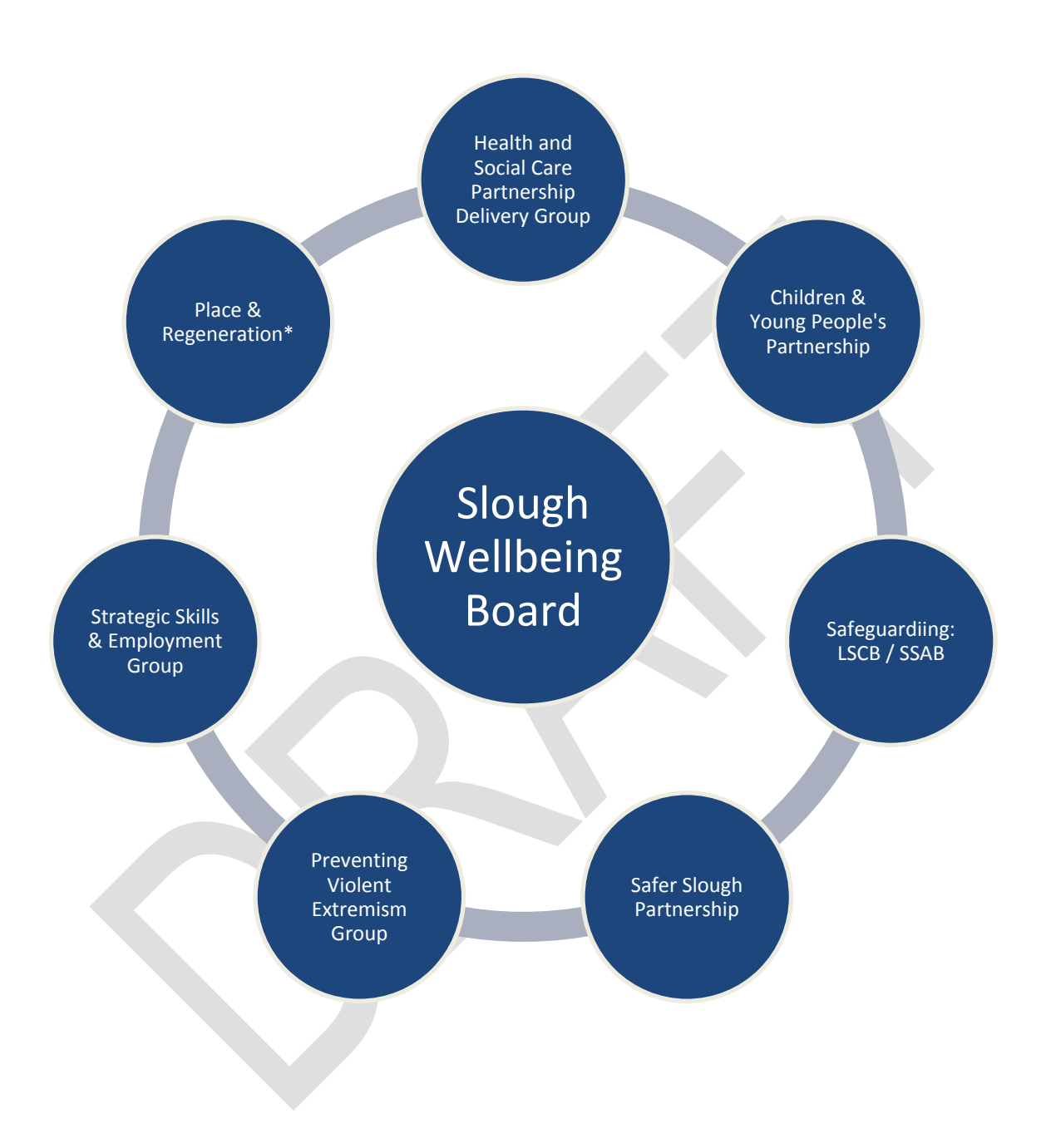
Diagram summarising key partnership groups in Slough